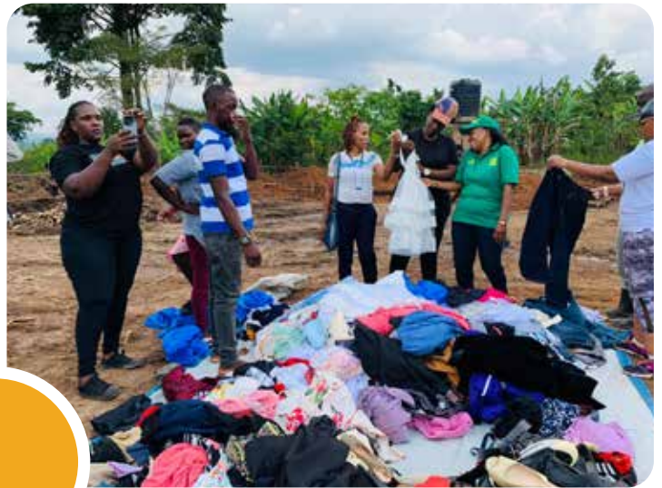
Rotary Club of Bunga Donates items to the people of Ssebbobo Community