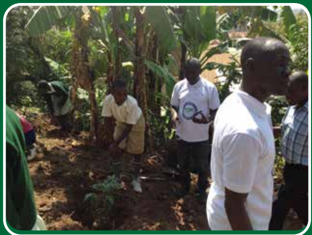
Tree planting at our Lady of Consolata Primary School Bweyogerere Catholic Parish