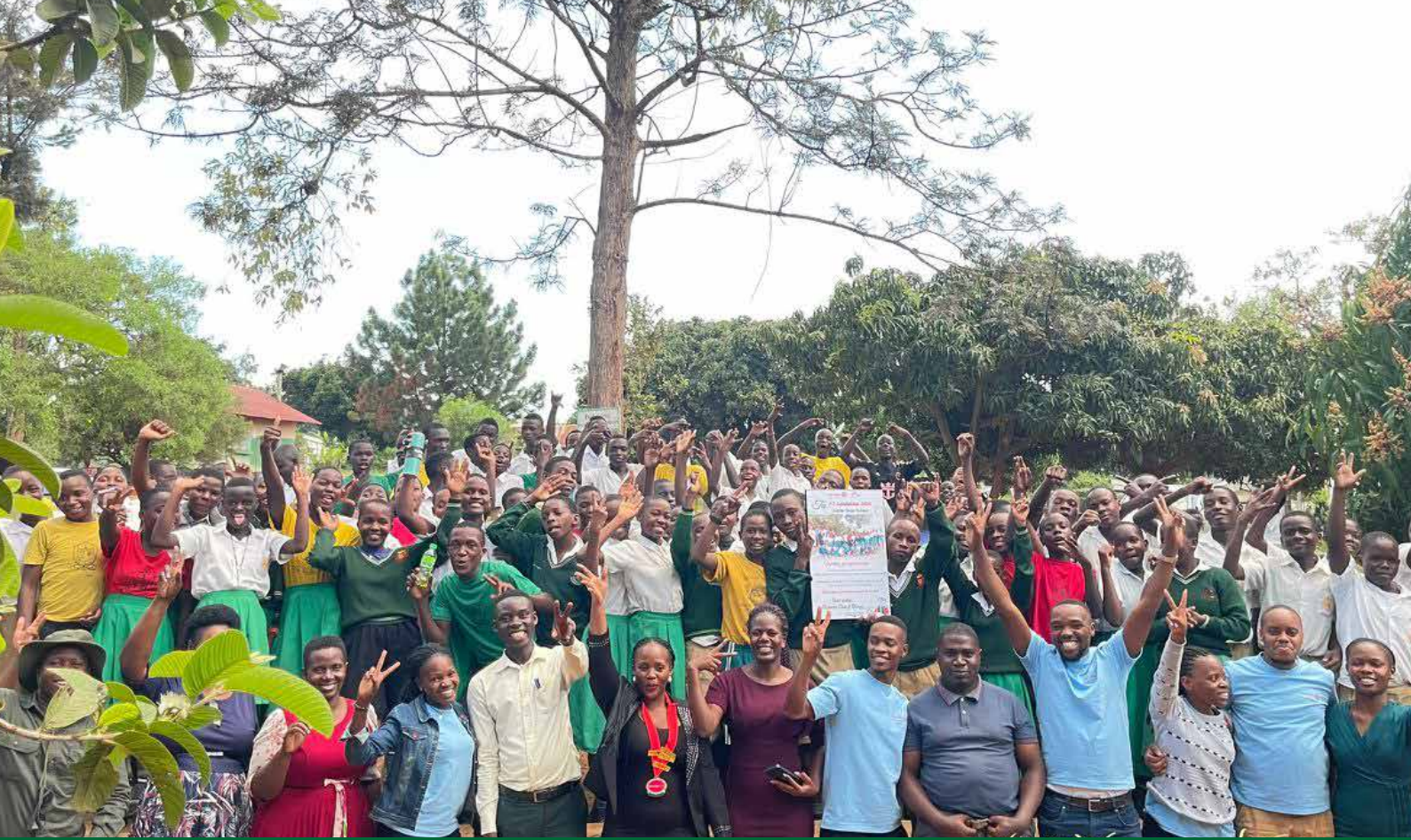
Rotaractors together with the P7 candidates class of 2024 at St Paul Ggaba Demonstration Primary School pose for a group photo.