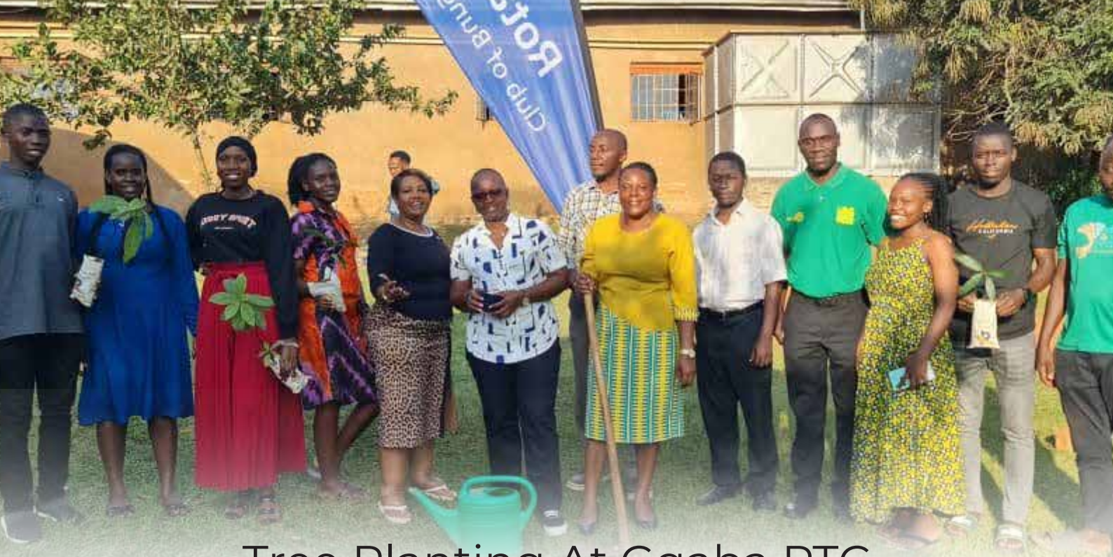
Tree Planting At Ggaba PTC