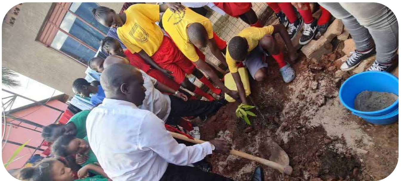
Tree planting at Bungu Hill Primary School