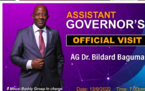
Our AG visited RC Bunga, and among other things, congratulated us and other Corridor Clubs, for delightfully welcoming the RI President to Uganda at Munyonyo on 31st Aug 2022.